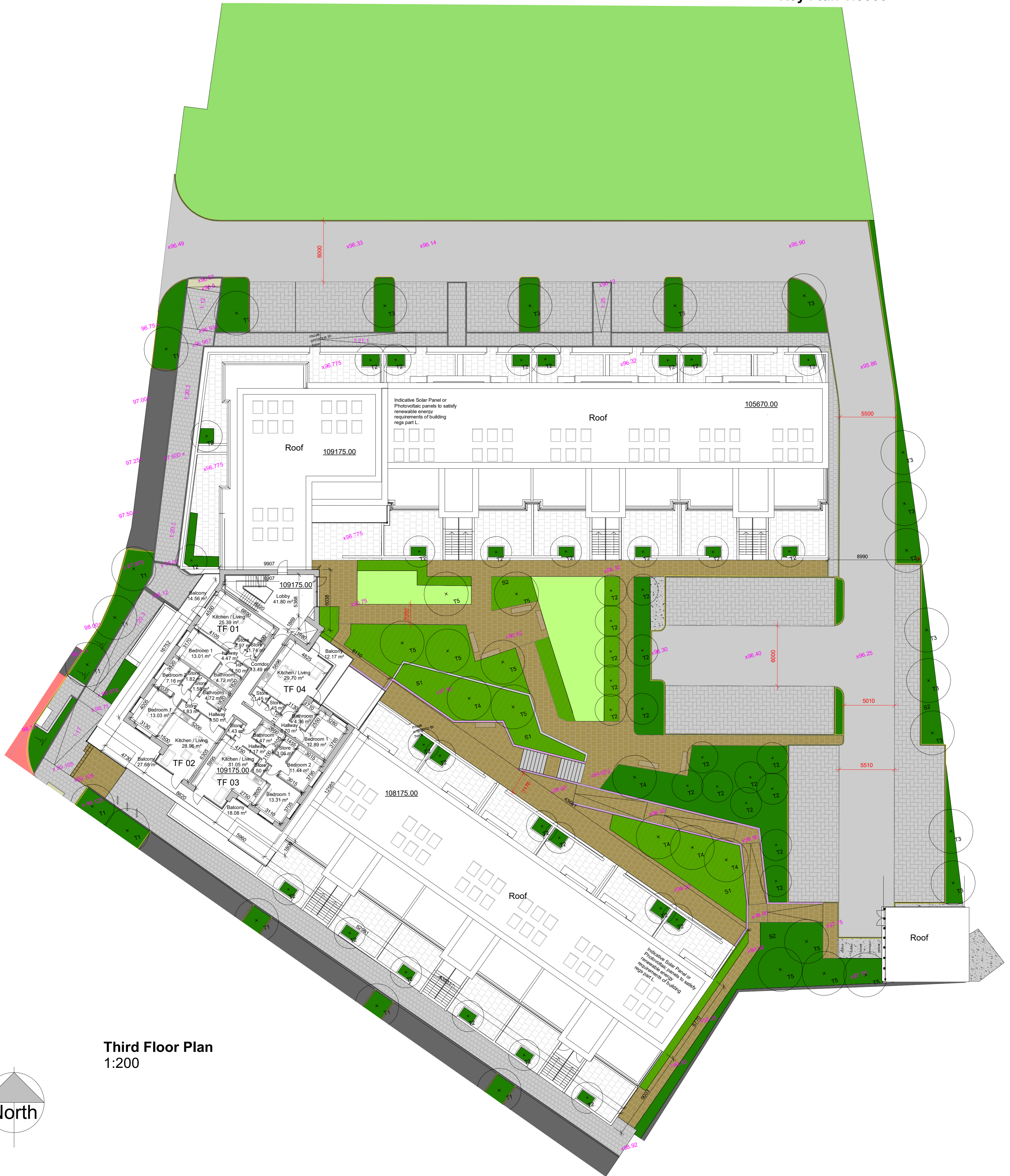
Third Floor Plan 1:200